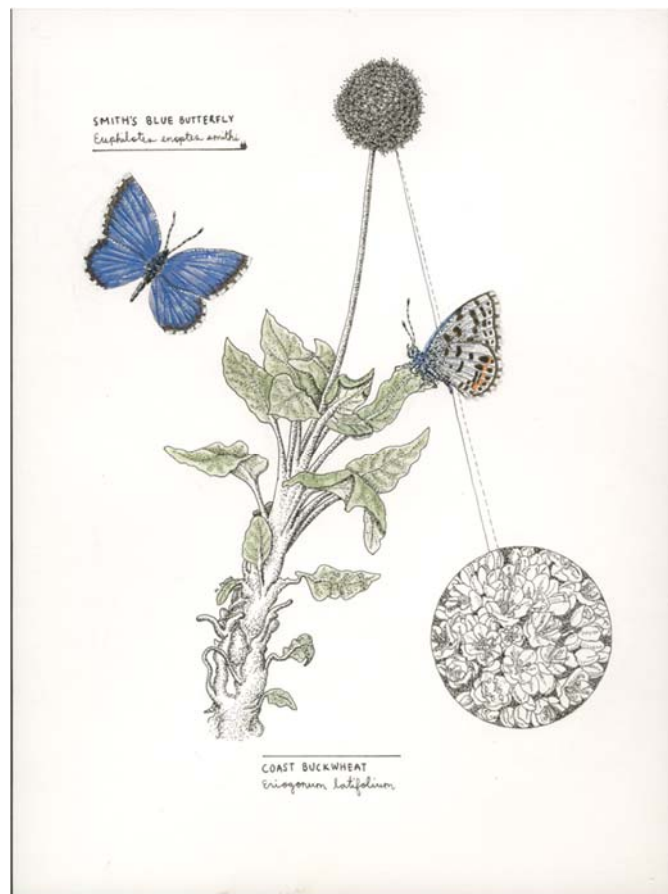
Figure 1. Smith's Blue Butterfly on host plant Coast Buckwheat

Entomology and collecting insects became a new goal for Randy after a pivotal moment in the sandhills. After